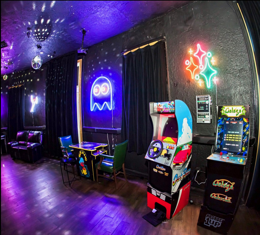
Stage Rolling DJ table