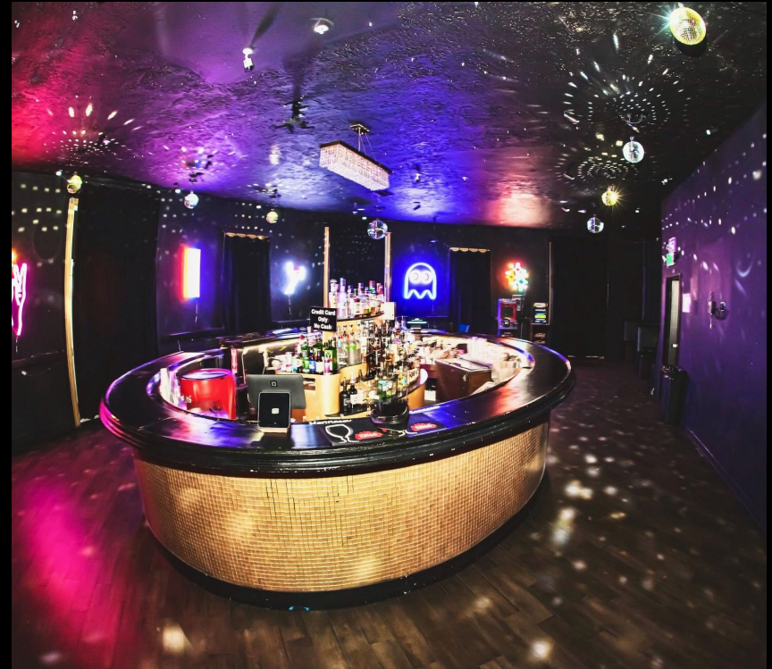
Sound 2x QSC K12.2